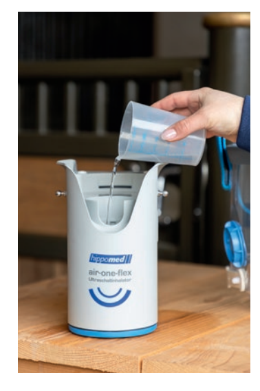
Fig. 1 Fill chamber 1 with contact liquid.