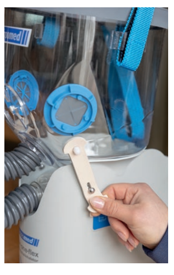
Secure the mask with rubber straps and attach the connection tube.